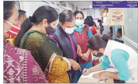
शिमला : इनरव्हील क्लब शिमला द्वारा श्री राम अस्पताल न्यू शिमला में आयोजित शिविर के दौरान पंजीकरण करवाती महिलाएं।